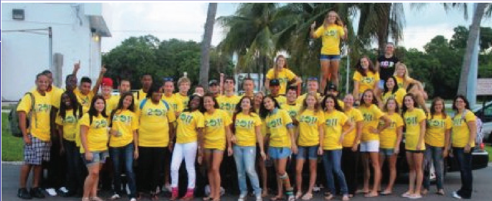
Seniors Arrive at School the First Day Ready to Take Over MHS and the World!