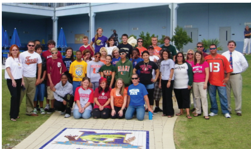
Pictured left: The high school AVID students, faculty and administrators model their college tees for College Day, Sept. 3, 2010